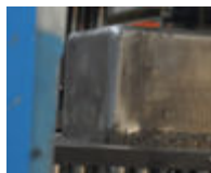
DEEP DRAWN ALUMINUM