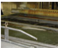
ALUMINUM AND METAL ANODIZING