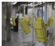
PAINTING & POWDERCOATING