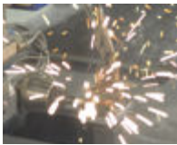
ALUMINUM LASER CUTTING