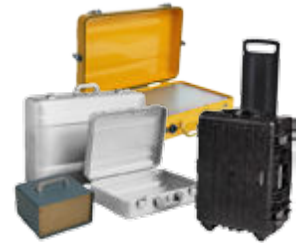
CARRY & INSTRUMENT CASES