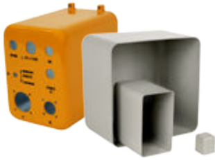
DEEP DRAWN HOUSINGS & VALUE ADDED PROCESSES