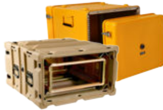
19" RACKMOUNT CASES