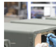
STANDARD & CUSTOM ASSEMBLY