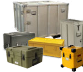
TRANSIT & STORAGE CONTAINERS